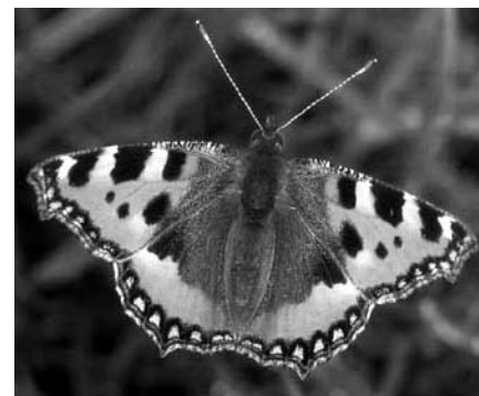
small tortoiseshell

The Wildlife Sites Project started a programme in 2000 to re-survey all sites. Once surveys are complete, this information is assessed by the Project's selection panel against a set of standard criteria.